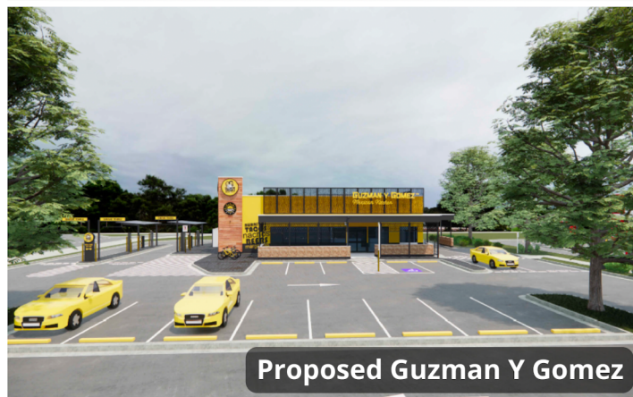
Proposed Guzman Y Gomez